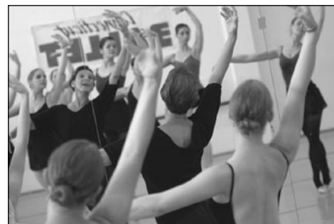
Cynthia Gregory teaching at last year's Audition Workshop.